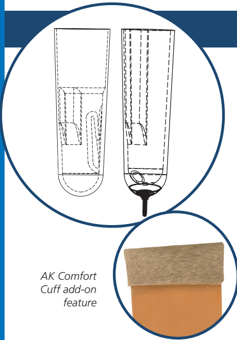
AK Comfort Cuff add-on feature